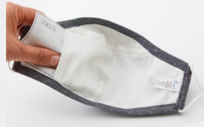
Pocket for optional Premier PR797 PM2.5 filter